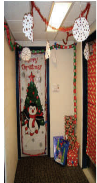
Second Place Door